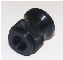
10 X Eyepiece