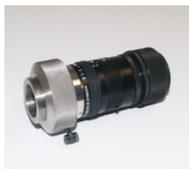
IG-1643 1.5:1 Relay Lens