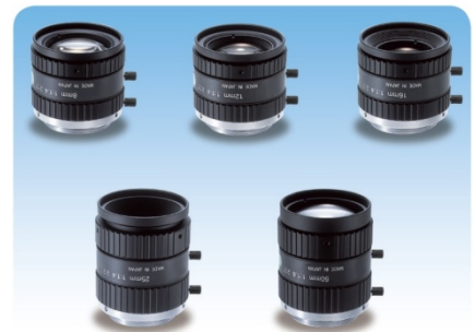
MORITEX- SCHOTT Mega Pixel CCTV Lenses ML-MP Series.