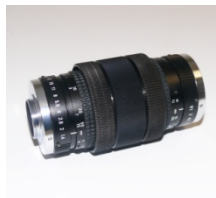
IG-1650 1:1 Relay Lens