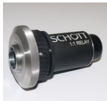
SCHOTT IG-1660 1:1 Relay Lens