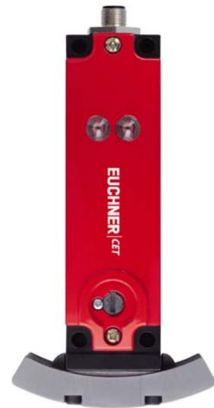
Figure 4: CET with double insertion slide for use, for instance, on indexing tables

If maximum protection against tampering is required, the non-contact guard locking CET is the perfect solution. With the CES unicode evaluation unit, a unique CET actuator is detected. Prior to setup, it is necessary to teach-in the related transponder on the unicode evaluation unit. Tampering with a second CET actuator with the safety guard open is then not possible. The CET is also fastened using safety screws. As a result, actuators that are already fitted cannot be removed from the safety guard – an additional protection against tampering.