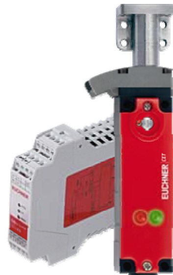
Figure 1: Combination of non-contact technology with mechanical guard locking – the non-contact guard locking CET

Safety switches with guard locking are, however, also used on machines to prevent unintentional opening of the door. Although a position switch would reliably stop the system, the production